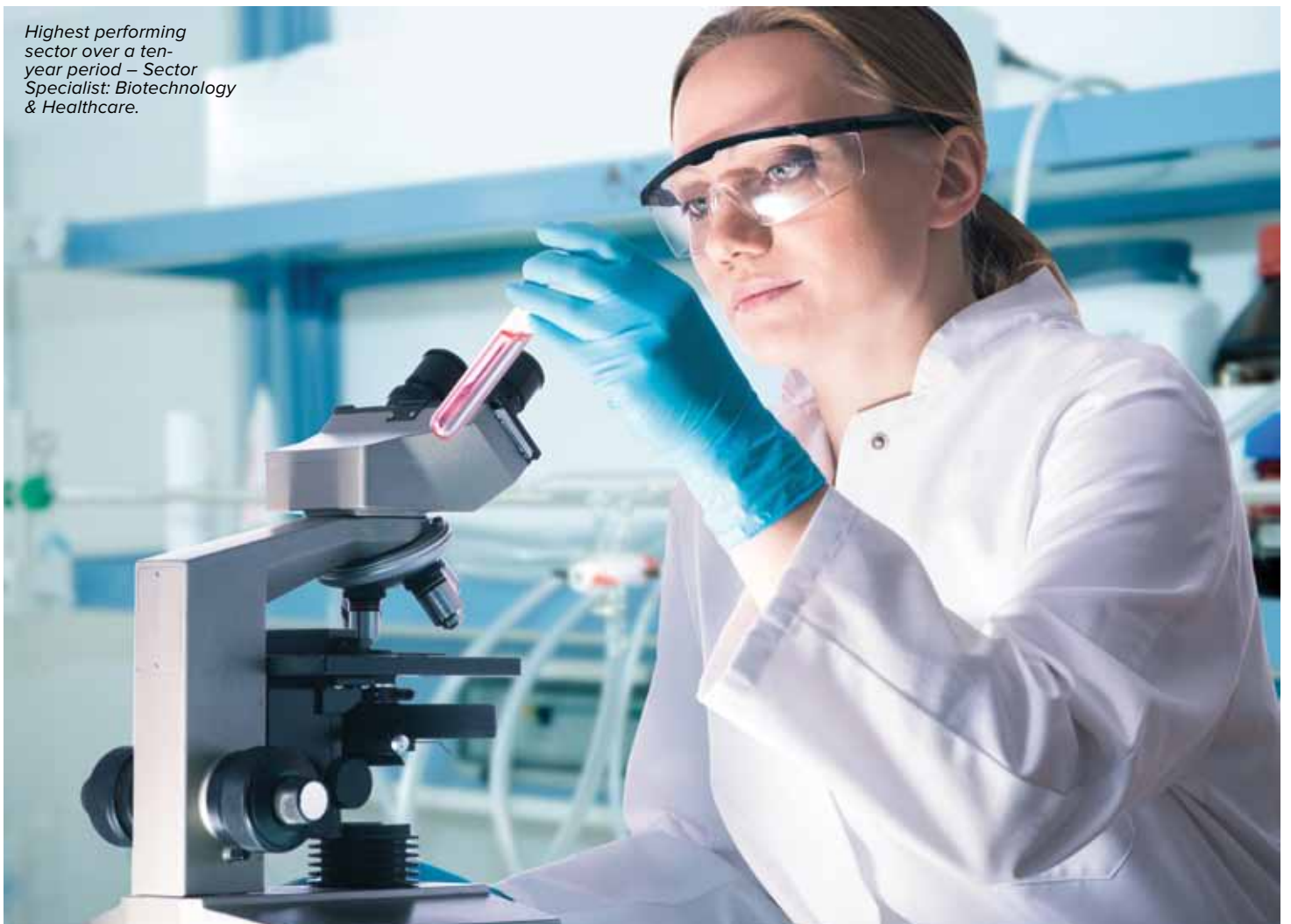
Highest performing sector over a ten-year period – Sector Specialist: Biotechnology & Healthcare.