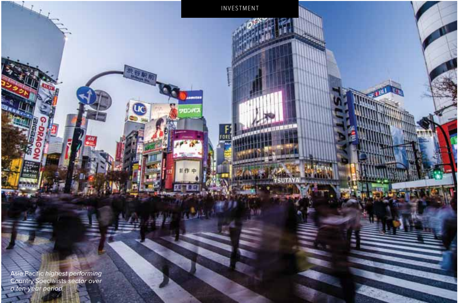
Asia Pacific highest performing Country Specialists sector over a ten-year period.